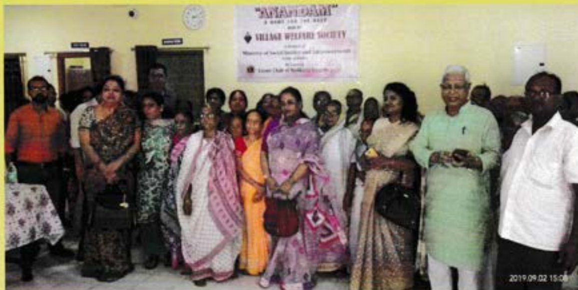
Old Age Home, Anandam