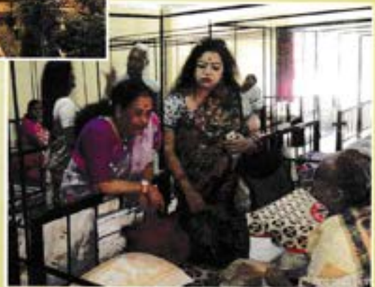
The Old Age Home of VWS, Anandam