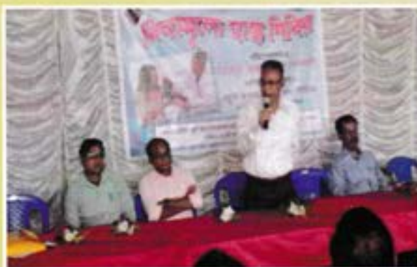
Free Health Check Up Camps