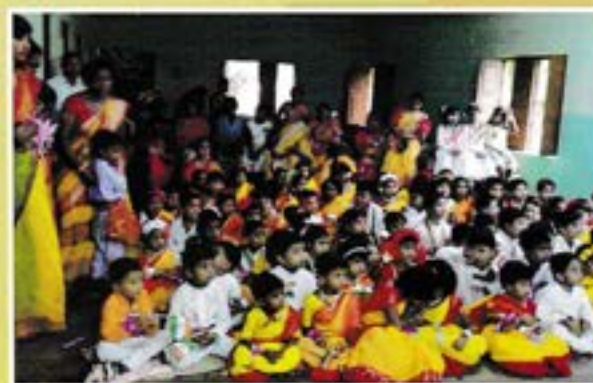
Village Model School